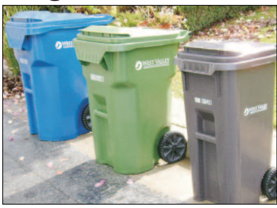
This is a correct cart set-out. Carts should be at the curb by 6 a.m. for service (with wheels against the curb). All materials go in carts, except oil jugs and oil filter bags, which must be placed curbside. The blue cart is for recycling, the green for green waste, and the brown for garbage.