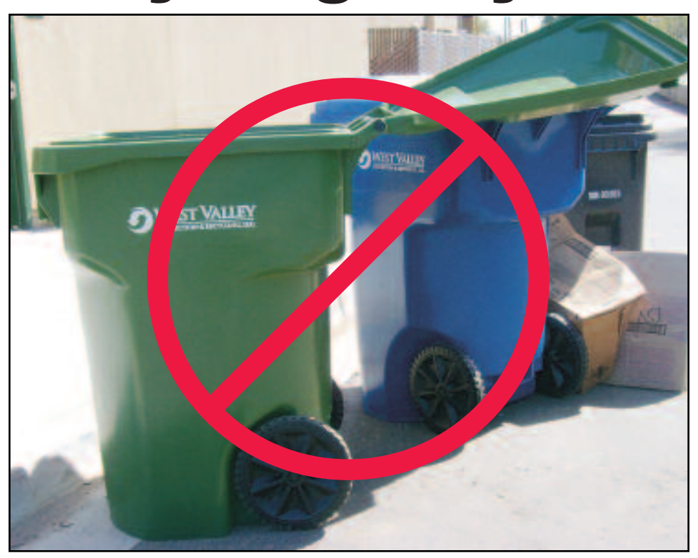
This is an incorrect cart set-out. The carts' wheels must be against the curb. All cardboard must be placed in the cart. Green waste must be placed in the cart. Lids must be closed.

Before kicking off the new single-stream recycling program, we talked to residents. Do you know what we learned? A simple set-out procedure would increase participation and a large container would encourage more recycling each week. We heard you!